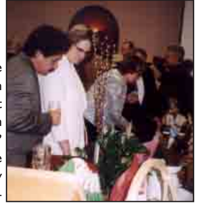
Silent Auction items rated close inspection by prospective bidders.