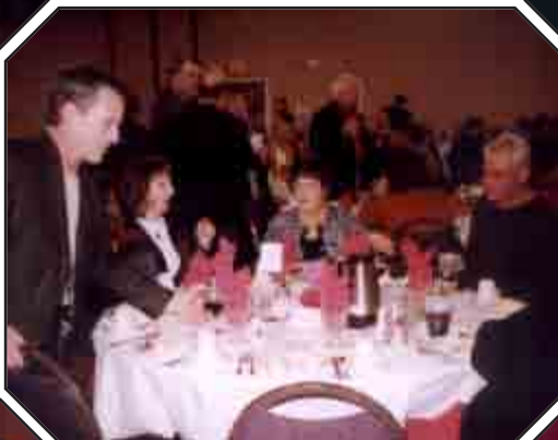
Guests enjoyed friendly service by volunteers at tastefully appointed tables.