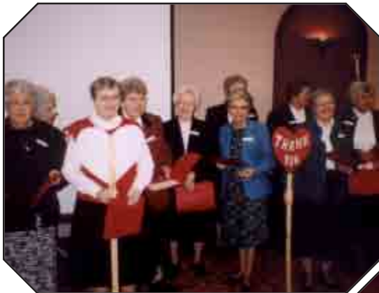
Appreciative Benedictines opened the 2009 banquet with a creative "Thank You" skit.